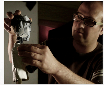
Shooting of No-Go Zone Selected and awarded in several festivals Broadcasting of "Court-circuits" and 1000 Jours on Arte.tv